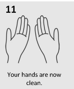
COVID-19: How to wash your hands/How to use hand sanitizer