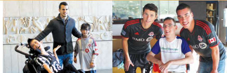
Holland Bloorview welcomed various Toronto FC players.

MLSE Foundation helped kids with disabilities get into the game through Busy Bodies.