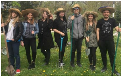
Working in Spiral Garden

Volunteering opportunities vary every year based on funding & resources but may include activities such as: