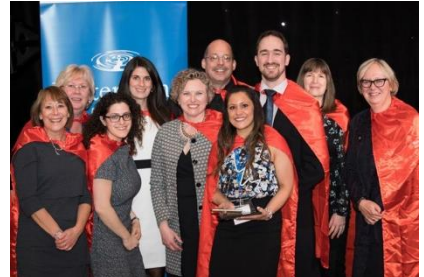
Activation of HB Programs

Discounted parking & on-site meals can be arranged, please reach out to your Holland Bloorview representative for more information.