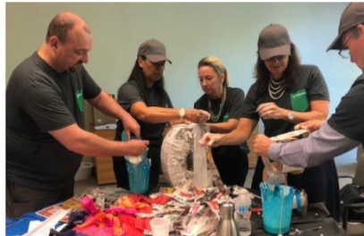
Crafts & Activities